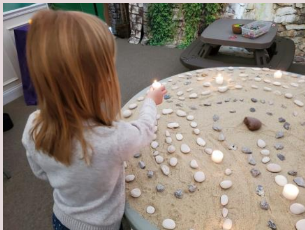
Sarah lighting a candle in the prayer stations (Garden of Gethsemane)